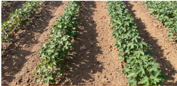
Cotton crop before MegaSilica application