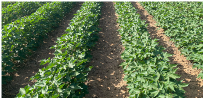
Cotton crop with MegaSilica 30 days after application