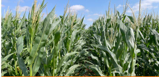
Sweet Corn crop